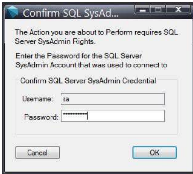
Figure 2. Confirm SQL SysAdmin screen